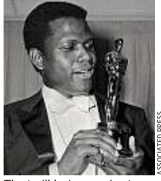
The trailblazing movie star knocked down barriers for Black actors in Hollywood. A3