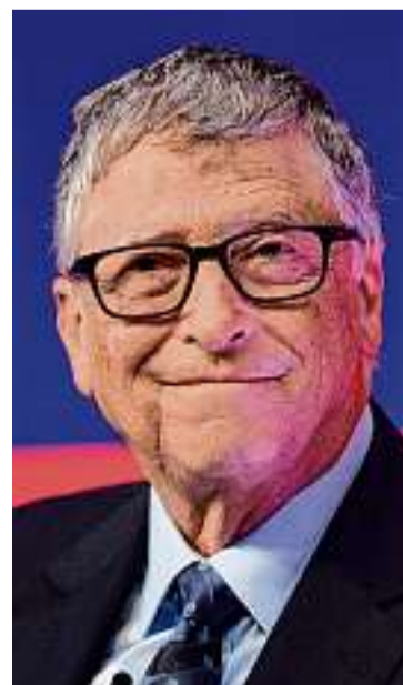
Left: A fuel-handling test facility at TerraPower, a nuclear energy company founded by Bill Gates (above).